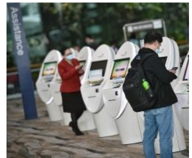
When will it be safe to work out or go on vacation?

Read the latest on the Covid-19 situation in Singapore and beyond on our dedicated site here.