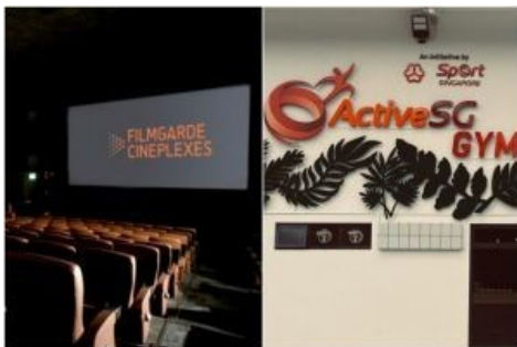
Bugis+ cinema and ActiveSG Gym in Sengkang visited by infectious coronavirus patients