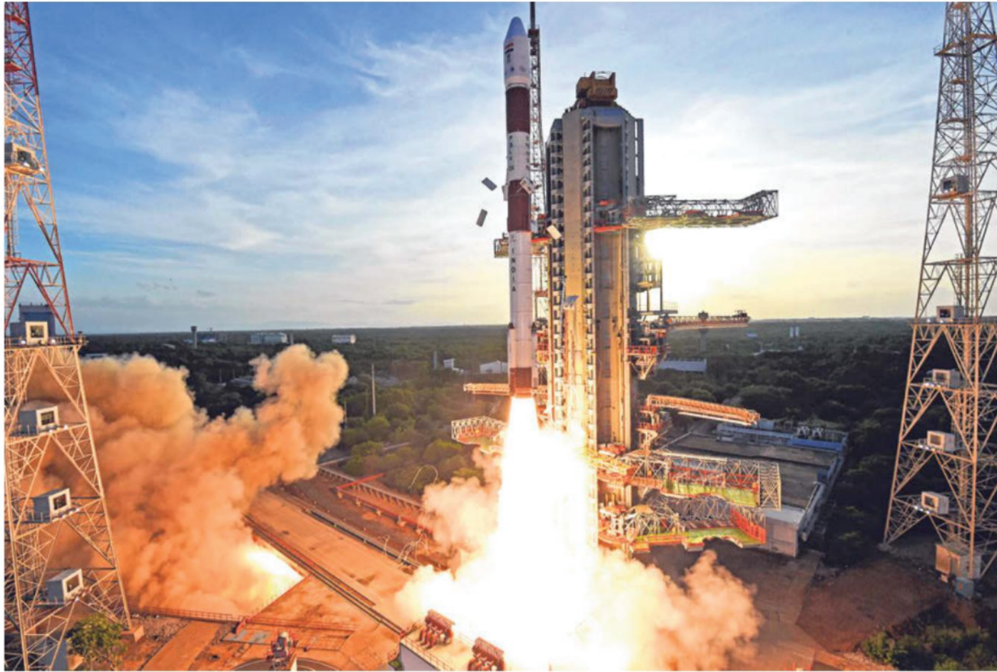
The 44m-tall rocket, called a Polar Satellite Launch Vehicle and carrying the three Singapore satellites, lifting off on Thursday from the Satish Dhawan Space Centre in South India. The satellites were released into orbit about 570km above Earth a little after 8.50pm Singapore time.